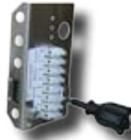
Event Counter Terminal Board