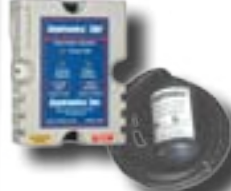
Dual Interior Alarm System