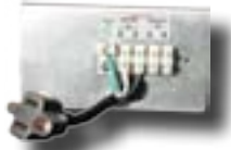
Std. Terminal Board