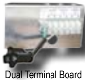
Dual Terminal Board