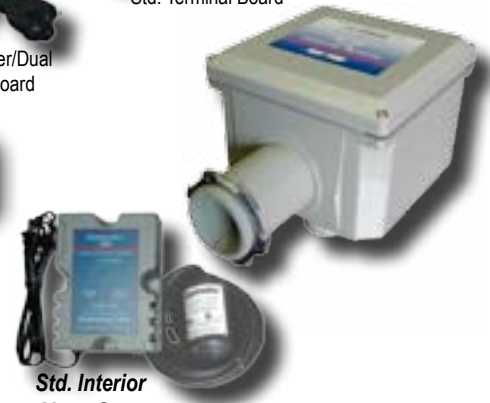
Std. Interior Alarm System

PMJ2DBX – 240V PMJ w/ Event Counter & 6 Pole Terminal Board (Order #2190)