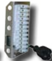
Event Counter/Dual Terminal Board